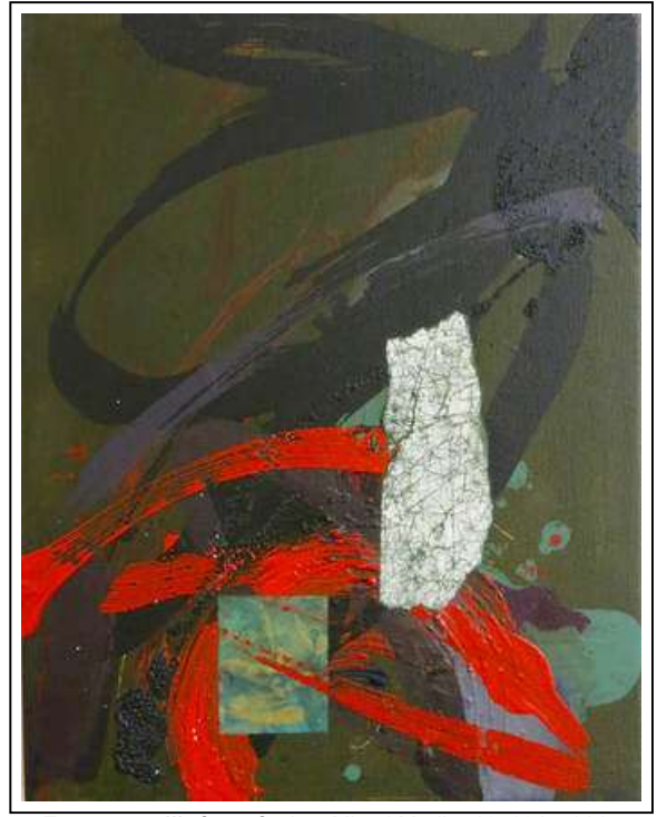
Emergence III, Cusp Series, Mixed Media, 18x16 in, 2017