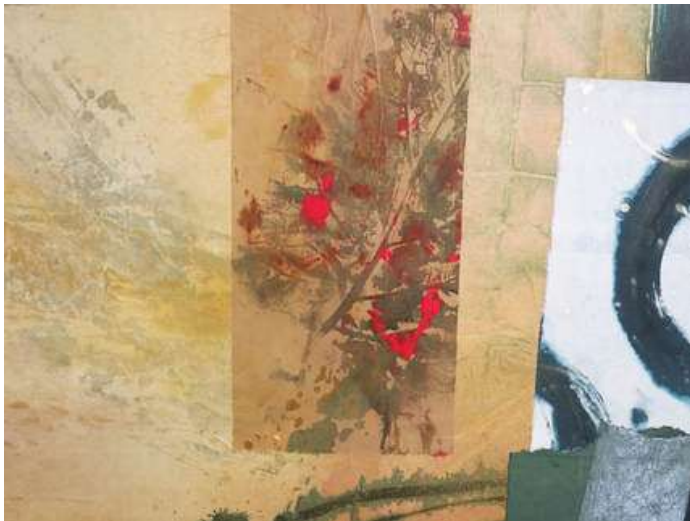
Detail: Emergence V, Cusp Series, Mixed Media, 36x72 in, 2015-2017