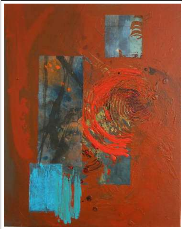
Spiral Interrupted, Cusp Series #005, Mixed Media, 20x16 in, 2017