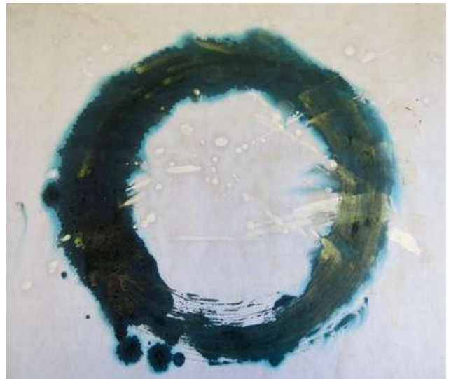
Detail: Enso II,