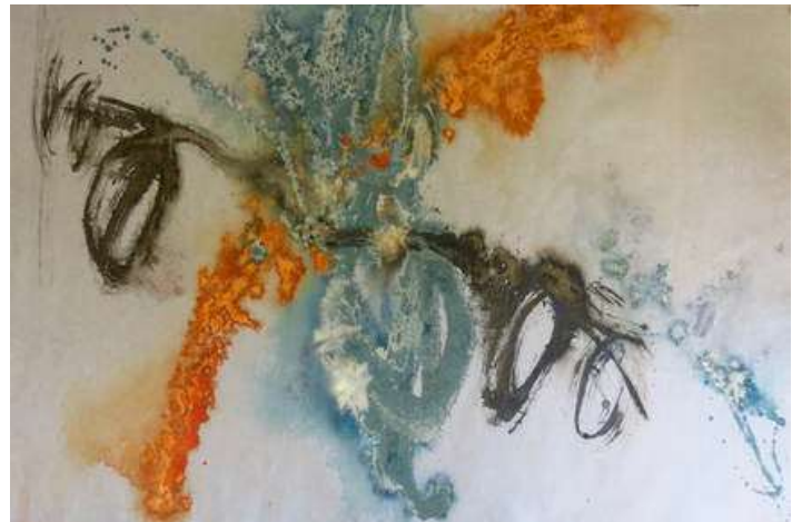
Water Emergence II, Ink &amp; acrylic on washi paper, 24x37 in, 2015

A variety of sizes, mediums and methods enliven Cusp .