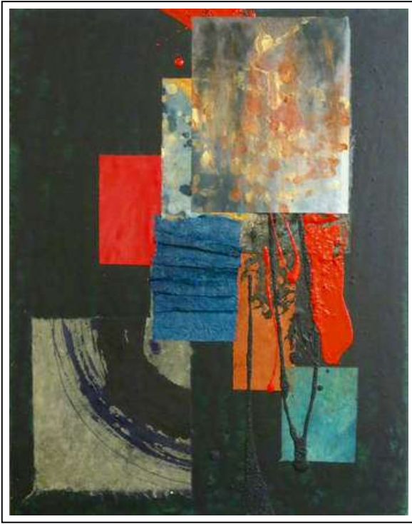
Emergence I, Cusp Series, Mixed Media, 18x16 in, 2017