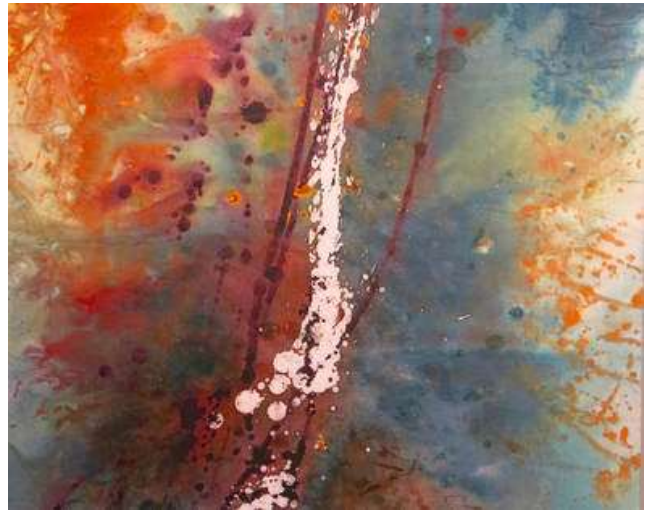
Detail: Rising / Falling, Mixed Media on Washi. 2017

Gage Gallery Arts Collective is located at 2031 Oak Bay Ave. Hours: Tues-Sat 11am-5pm. Phone: 250-592-2760.