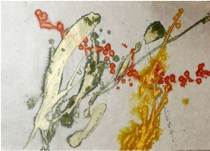
Co-emergence II, Mixed media on washi paper, 24x36 in, 2015