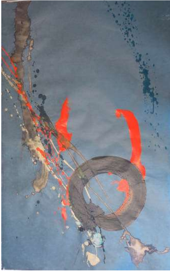
Enso Rising I, Ink on Japanese washi paper, 40x24 in, 2017.