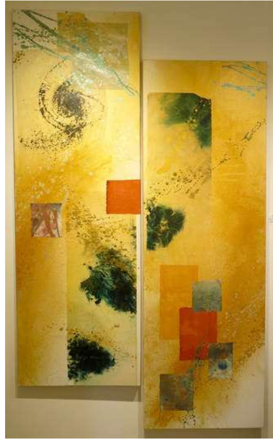
Golden Temple, Rising/Falling, Mixed Media, Diptych, 2017

In Enso Rising I (above left) the artist refers to the Zen Buddhist symbol enso. Drawn for centuries by followers of Zen, the circular shape symbolizes the harmonious nature of enlightened mind. Enso describes an emptiness of form and totality of being that encapsulates the paradox of Buddha nature. Streaks of colour, dots and dashes stream upward from the enso image. The blue background is peaceful; bright red accents focus our attention.