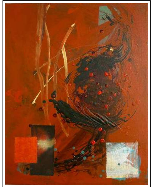
Trait, Cusp Series #002, Mixed Media, 20x16 in, 2017

Yamada's early experiments with monotypes included imprinting, etching and embossing. These techniques evolved into mixed media and collage paintings. Never still and static, Yamada's experiential art-making is a journey of discovery. Cusp features a series of compact acrylic on canvas mixed media paintings. The noun "cusp" has several meanings: a point of transition between different states, a fold in a major blood vessel that makes a valve, part of a Gothic arch, a mathematical reversal of direction, and the pointed ends of a crescent moon. "I like my titles to resonate with several meanings," she says. "Changes, endings, beginnings, everything is in flux, on the verge of becoming other."